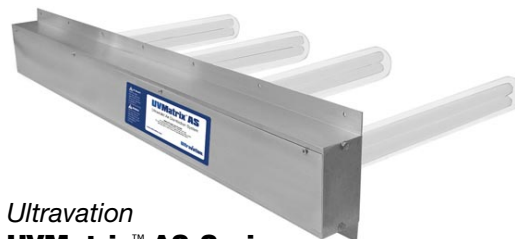
Ultravation UVMatrix™ AS-Series UV equipment designed specifically for air disinfection for use in large air handlers and duct systems