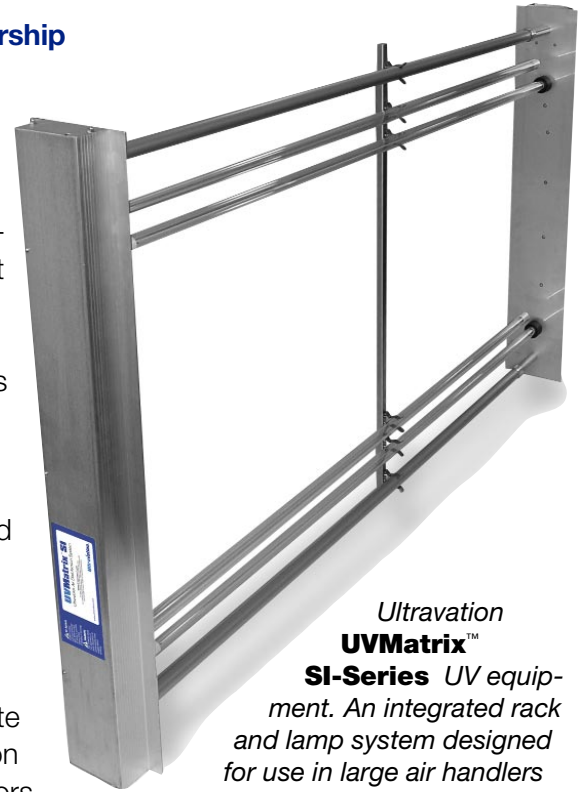
Ultravation UVMatrix™ SI-Series UV equipment. An integrated rack and lamp system designed for use in large air handlers