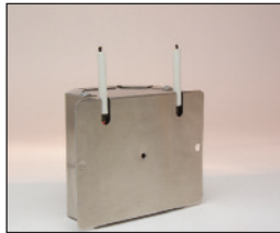
Internal mount electrode position

Positive and negative ions are emitted from the two adjustable electrodes. A magnet is provided for attaching the unit internally.